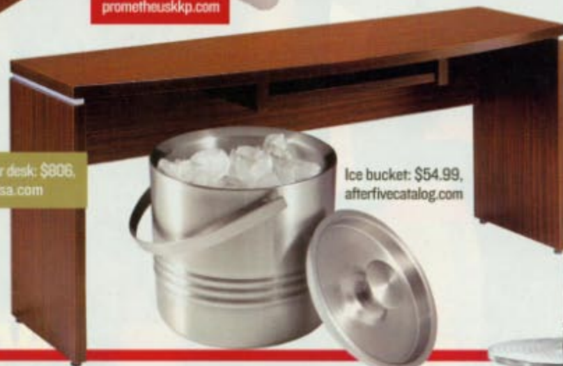
Macassar desk: $806, gautierusa.com