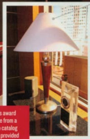
"This award came from a prop catalog that provided the inscription: 'City of Boston Award of Merit.'"

"According to his diplomas [not shown], which we got from a prop company, Denny went to Harvard undergrad, where he got both a Bachelor of Arts and a Juris Doctor degree—and then he went to Harvard Law School. I don't know why that is—that's wrong."