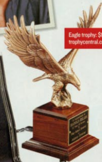
Eagle trophy: $199, trophycentral.com