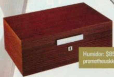
Humidor: $850, prometheuskkp.com

TUNEIN! Trading Spaces on TLC, weekdays at 4 pm, and Saturdays at 9 pm