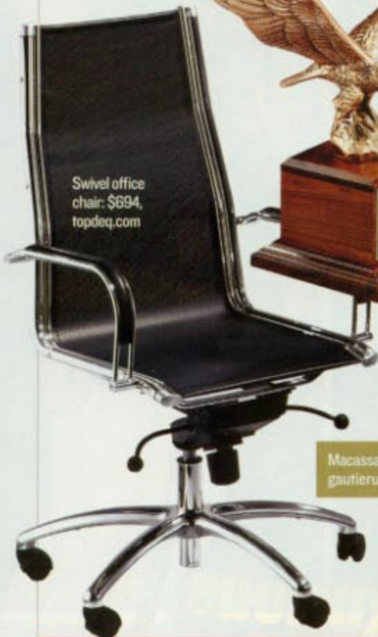
Swivel office chair: $694, topdeq.com