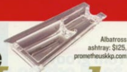
Albatross ashtray: $125, prometheuskkp.com

It doesn't take a Denny Crane salary to create a cool-looking workspace, says Carter Oosterhouse of TLC's Trading Spaces