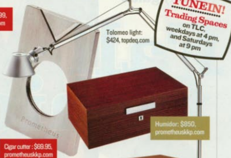
Tolomeo light: $424, topdeq.com

TUNEIN! Trading Spaces on TLC, weekdays at 4 pm, and Saturdays at 9 pm