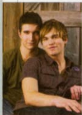
As The World Turns ' Noah and Luke