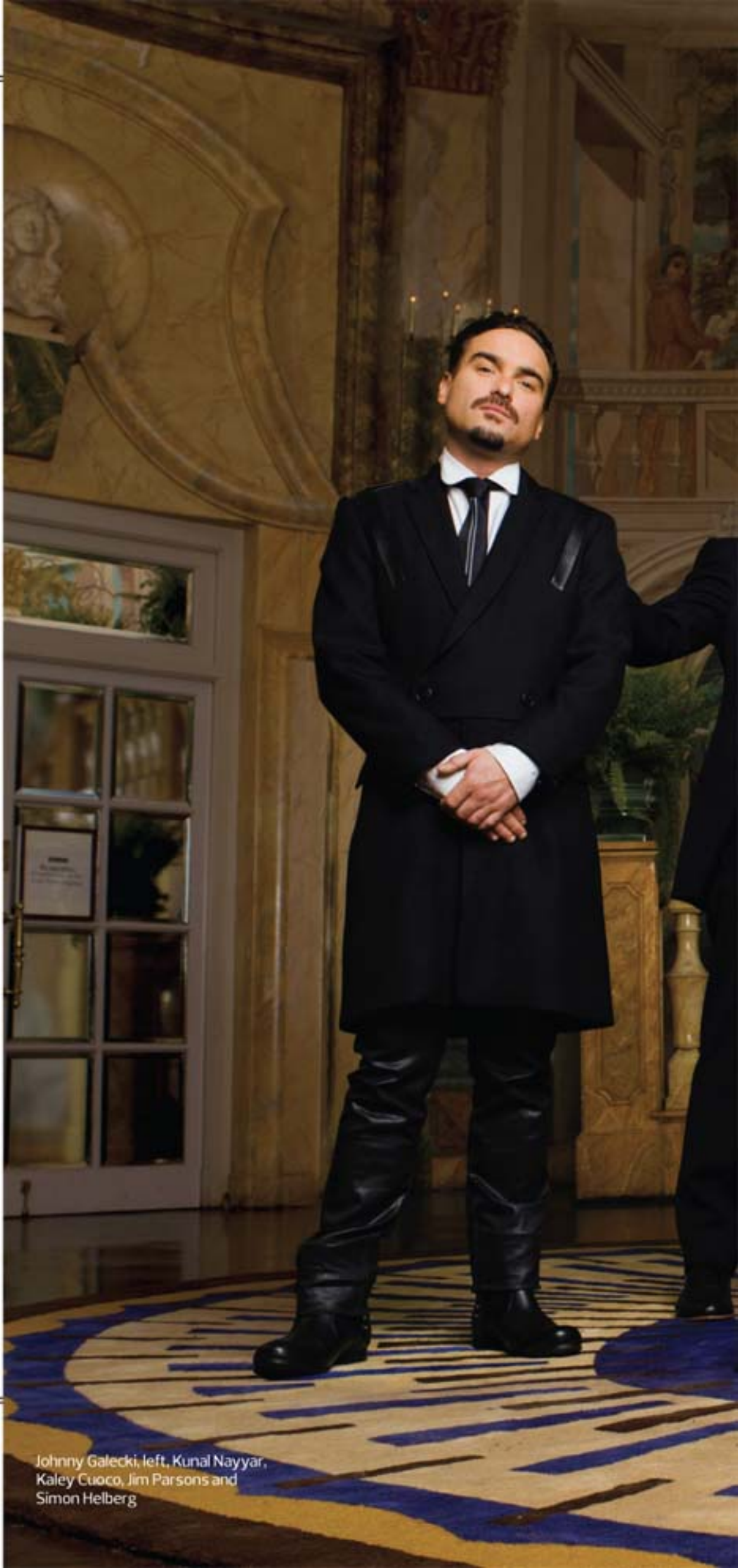
Johnny Galecki, left, Kunal Nayyar, Kaley Cuoco, Jim Parsons and Simon Helberg