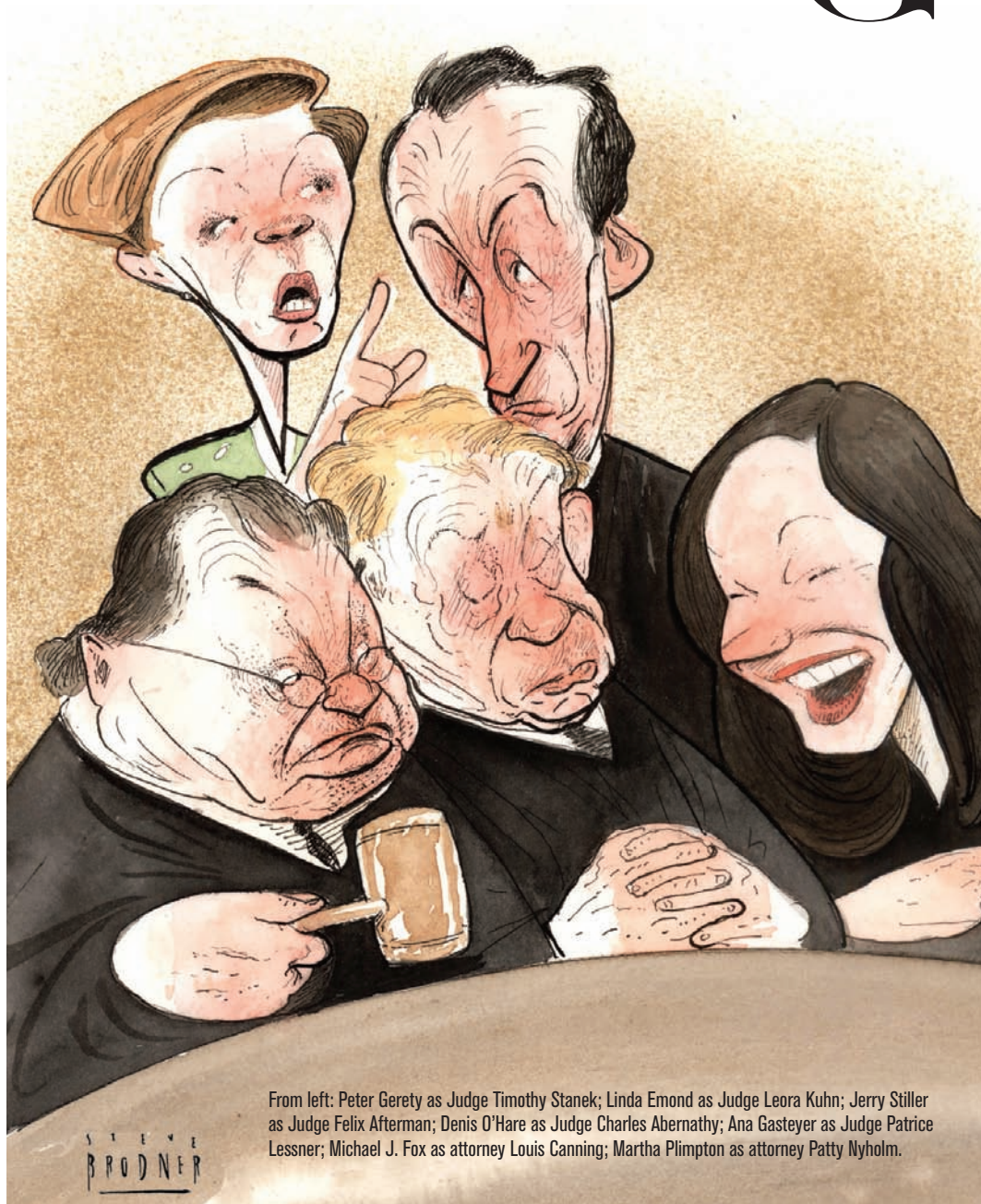
From left: Peter Gerety as Judge Timothy Staneck; Linda Emond as Judge Leora Kuhn; Jerry Stiller as Judge Felix Afterman; Denis O'Hare as Judge Charles Abernathy; Ana Gasteyer as Judge Patrice Lessner; Michael J. Fox as attorney Louis Canning; Martha Plimpton as attorney Patty Nyholm.