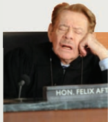
JERRY STILLER (Judge Felix Afterman)

"As I see it, Judge Afterman had forgotten his hearing aid, and so he closed his eyes trying to concentrate on the testimony. But everyone thought he was asleep. In fact, on the street ever since, I'm always in shock when people come up to me and say, 'You were asleep!' For the few minutes I was on, it's amazing to get such feedback."