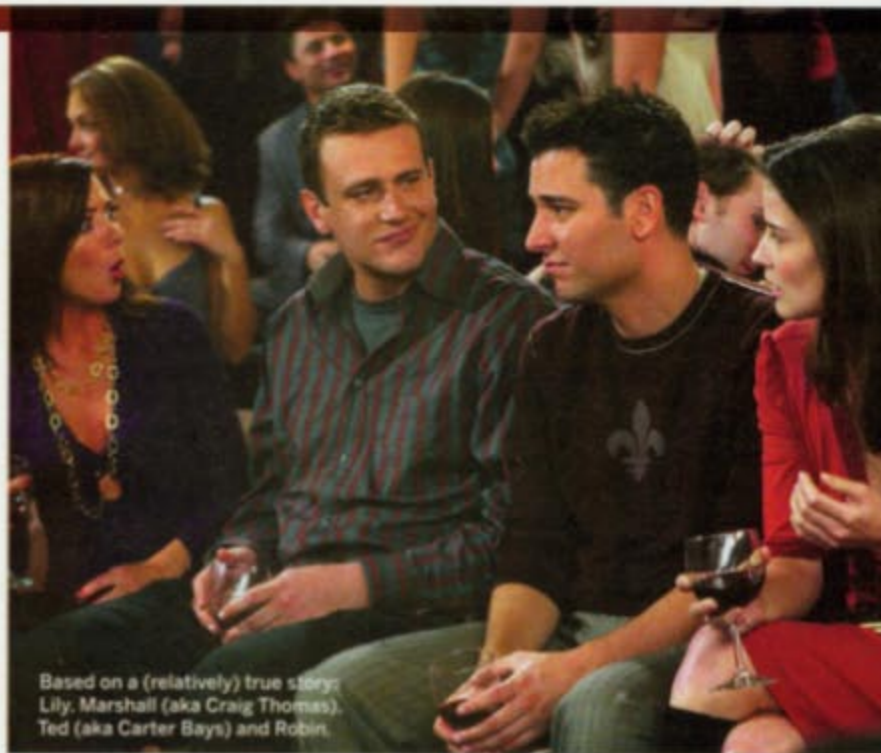
Based on a (relatively) true story: Lily, Marshall (aka Craig Thomas), Ted (aka Carter Bays) and Robin.

Roommates still, the two settled into life in New York, in apartments—first, by their description, "just a crappy shoebox" and then, once they realized they would survive in late-night TV, one only slightly nicer, on 75th Street between Broadway and Amsterdam Avenue. With its deliberately peeling paint and 75th Street address, Marshall and Ted's current apartment is modeled after memories of this second place. It's furnished with mismatched, seemingly secondhand pieces, as the creative duo's had been (Bays had driven a truck back from Cleveland filled with possessions from his parents, who divorced late in life, just like Ted's). But Bays and Thomas did have to take some license in re-creating their tiny bachelor pad on TV. Although they didn't