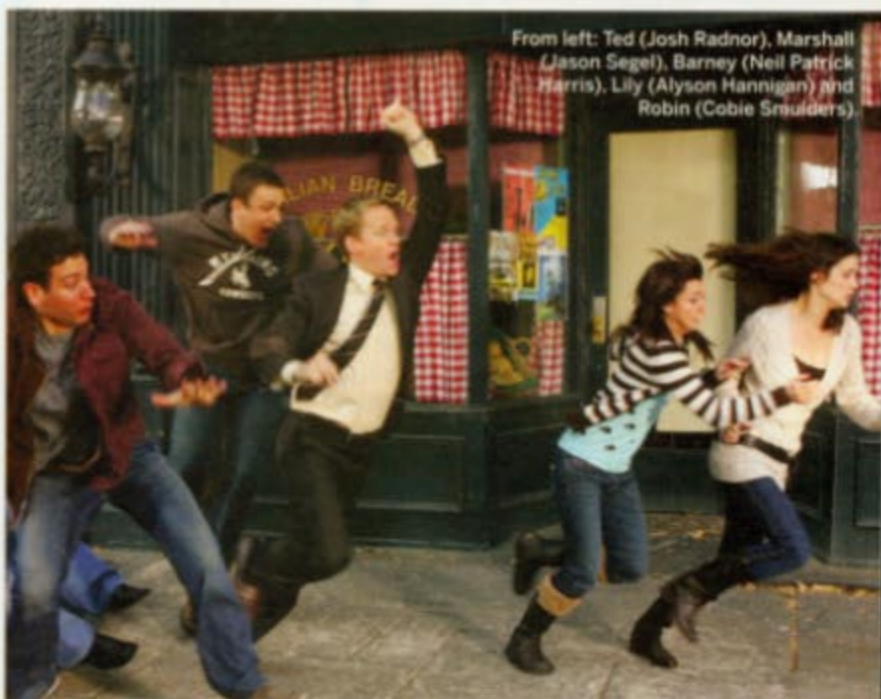
From left: Ted (Josh Radnor), Marshall (Jason Segel), Barney (Neil Patrick Harris), Lily (Alyson Hannigan) and Robin (Cobie Smulders).