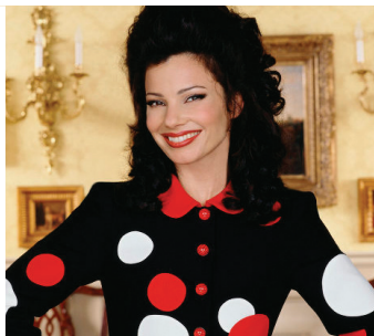
Fran Fine (Fran Drescher)