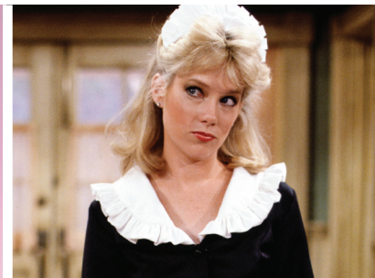
Stephanie Vanderkellen (Julia Duffy)