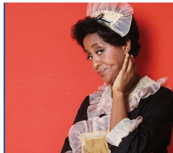
Florence Johnston (Marla Gibbs)