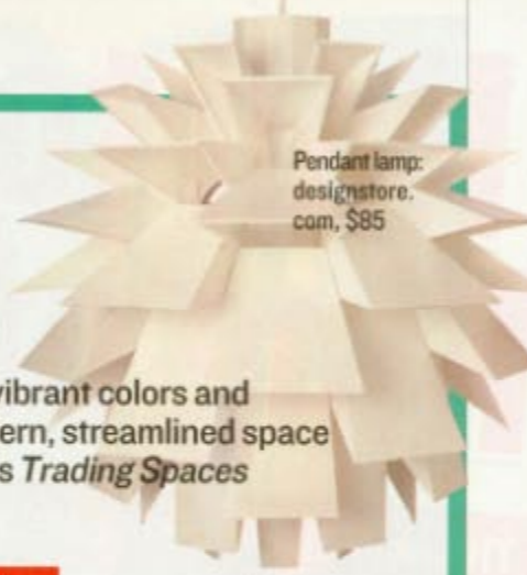
Pendant lamp: designstore.com, $85

Soft shapes, vibrant colors and rich textures help to warm a modern, streamlined space says Carter Oosterhouse of TLC's Trading Spaces