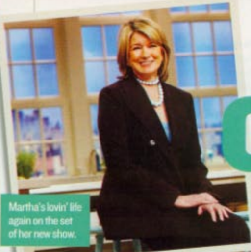
Martha's lovin' life again on the set of her new show.

TUNEIN! The Apprentice: Martha Stewart on NBC, Wednesday at 8 pm