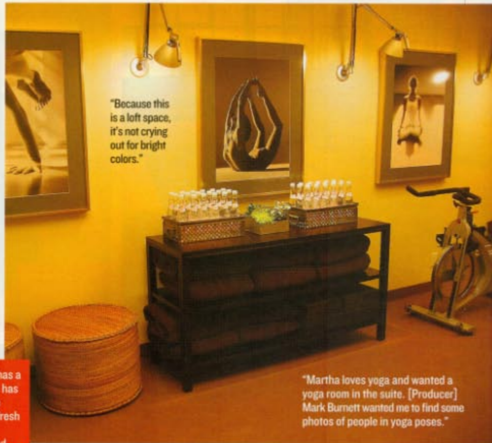
"Because this is a loft space, it's not crying out for bright colors."