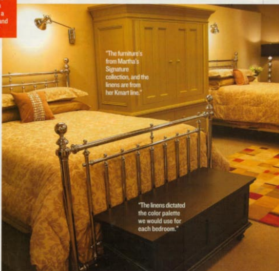
"The furniture's from Martha's Signature collection, and the linens are from her Kmart line."