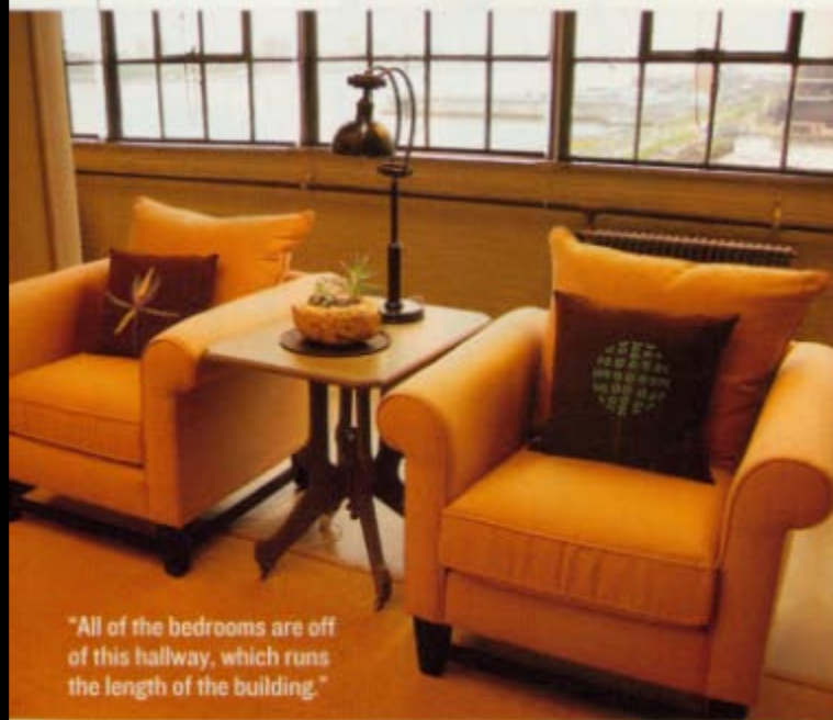
"All of the bedrooms are off of this hallway, which runs the length of the building."