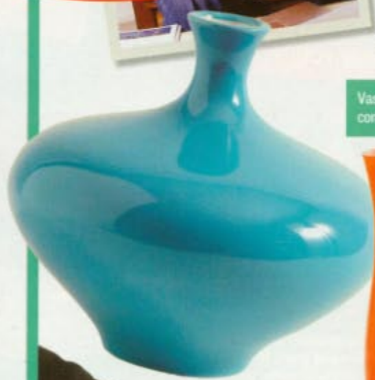
Vases: interiorshome.com, $7 to $59