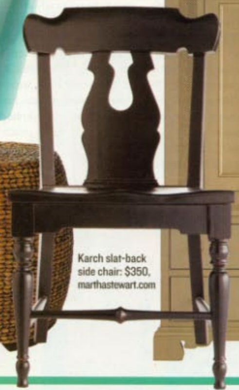
Karch slat-back side chair: $350, marthastewart.com