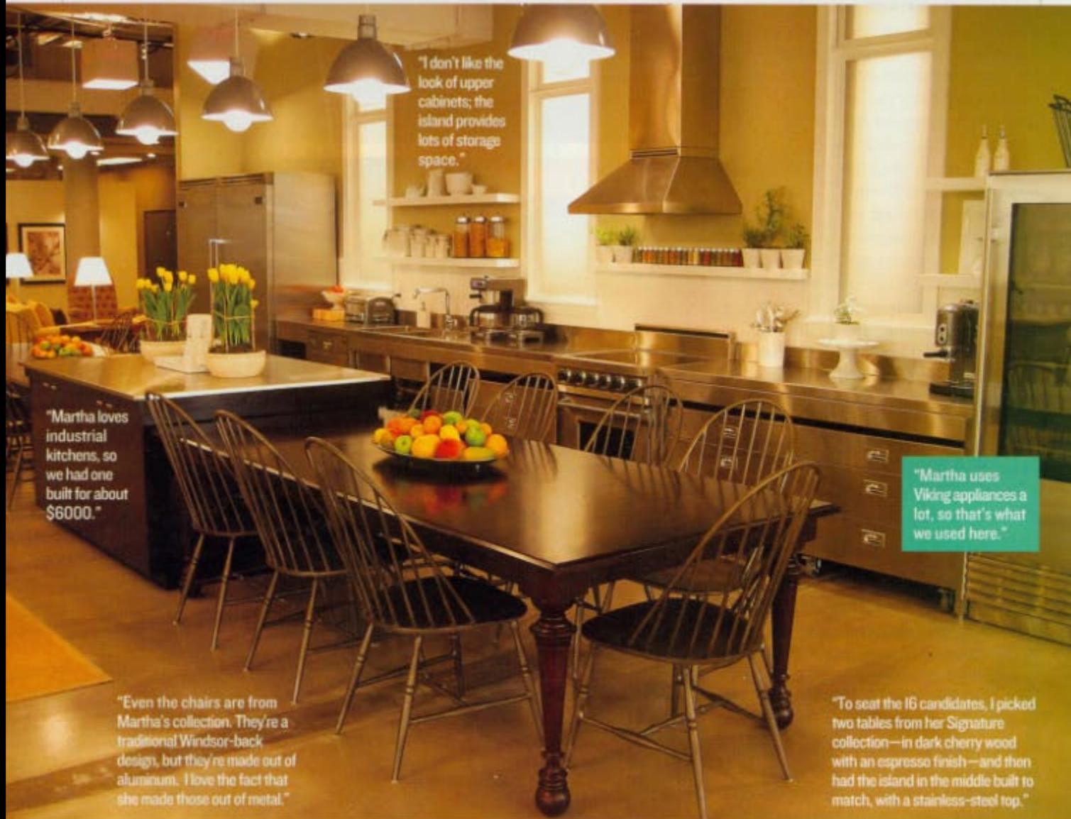
"I don't like the look of upper cabinets; the island provides lots of storage space."