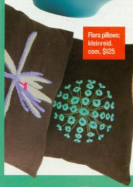
Flora pillows: kleinreid.com, $125