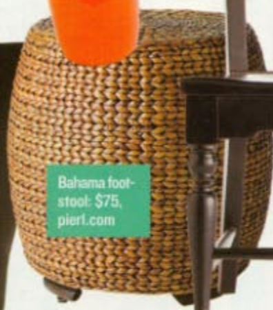
Bahama footstool: $75, pier1.com