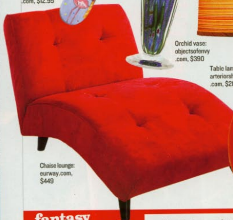
Chaise lounge: eurway.com, $449

TUNEIN! Trading Spaces on TLC, weekdays at 4 pm, and Saturdays at 9 pm