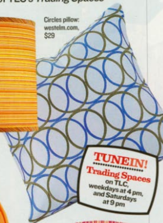
Circles pillow: westelm.com, $29

TUNEIN! Trading Spaces on TLC, weekdays at 4 pm, and Saturdays at 9 pm