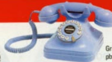
Grand phone: pbteen.com, $59