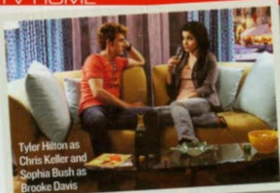
Tyler Hilton as Chris Keller and Sophia Bush as Brooke Davis