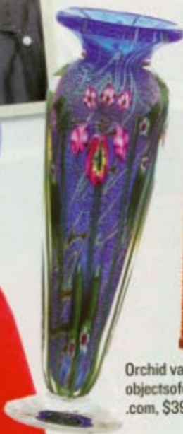
Orchid vase: objectsofenvy.com, $390