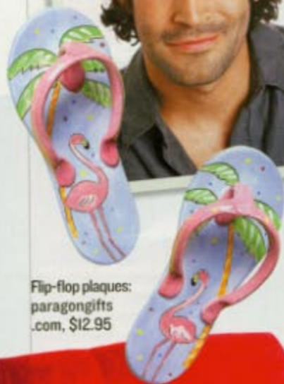
Flip-flop plaques: paragongifts.com, $12.95