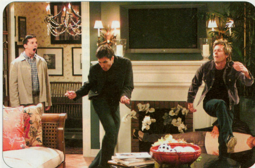
■ Will cuts footloose with guest Kevin Bacon, to Jack's subtle chagrin.